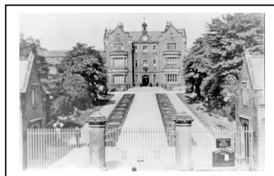
Nether Edge Hospital