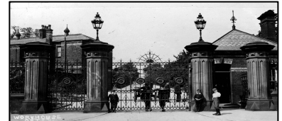
Northern General Hospital