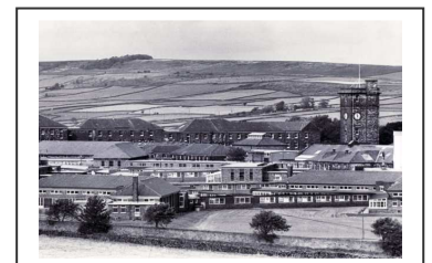
Lodge Moor Hospital